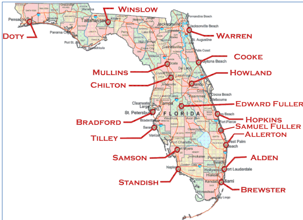
Figure 1: Map of Florida Society of Mayflower Descendants Colonies.

Florida is regionally organized into 17 Colonies, each having a Colony Historian who assists applicants with preparing their membership applications. Membership in a Colony is generally based on member location to the Colony, not the name of their Pilgrim. See the map in Figure 1 on the next page for a Colony near you.